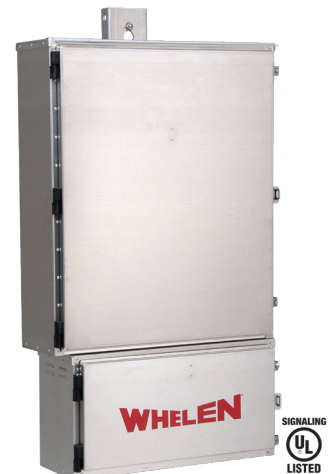
IPS1200 TYPE II Electronic Cabinet

All of the above speakers (except WS100) include level adjustment multi-tap transformers and a capacitor for line level supervision.