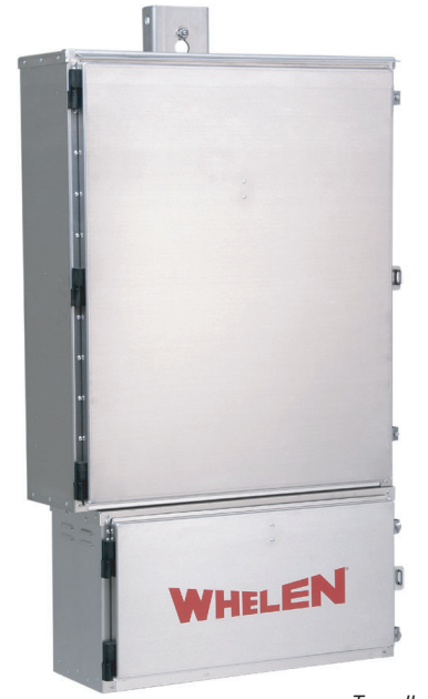
Type II Electronic Cabinet

MARNING: This product may contain chemicals known to the State of California to cause cancer and birth defects or other reproductive harm. For more information, visit whelen.com/regulatory.