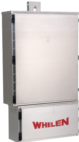
Type II Electronic Cabinet

Did we mention durability? Oregon's Cannon Beach has been using a Whelen system to warn its residents and tourists alike since 1988.