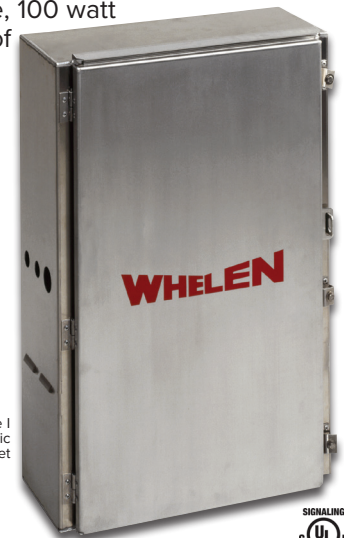
Type I Electronic Cabinet

All of the above speakers (except WS100) include level adjustment multi-tap transformers and a capacitor for line level supervision.