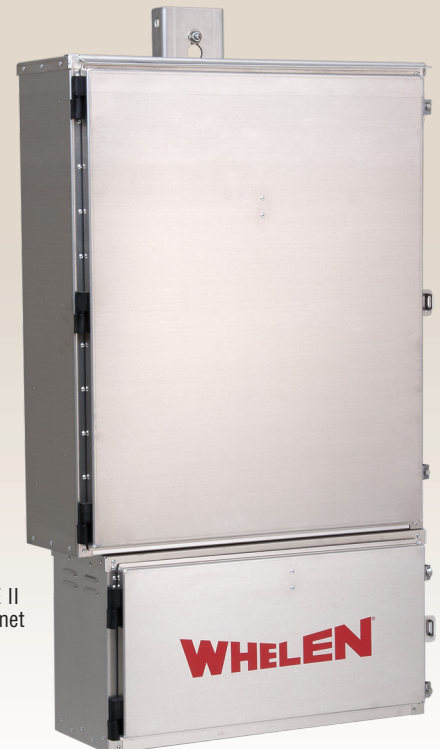
IPS1200 TYPE II Electronic Cabinet

All of the above speakers (except WS100) include level adjustment multi-tab transformers and a capacitor for line level supervision.